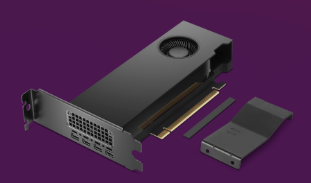
NVIDIA® A2000 12GB Graphics Card